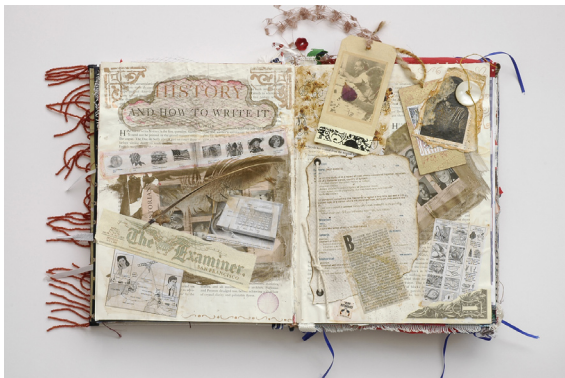
Stars and Stripes: A Tapestry of American Dreams and Realities Leslie Wilson-Rutterford

I think people who can keep up with the media will collect digital media. But, also people who are immobile and/or can't turn pages, but can push a button and look at a screen. Hospitals, schools and art house cinemas are potential venues for viewing digital books.