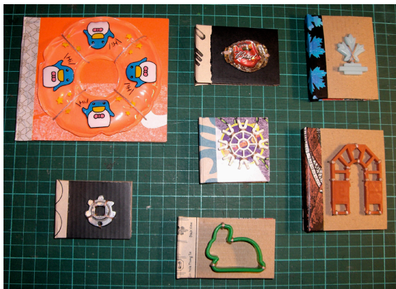
Found & Bound books, Leslie Wilson-Rutterford

Production processes for artists' books include: Inkjet on various handmade bound books, hand-drawn/ Letterset, Rubber stamps, Transfers, the use of found and recycled objects and materials, altered books and sculptural books. I have also ventured into freelance teaching of creative book-making processes to schoolchildren, based around curriculum themes such as recycling and WW11.