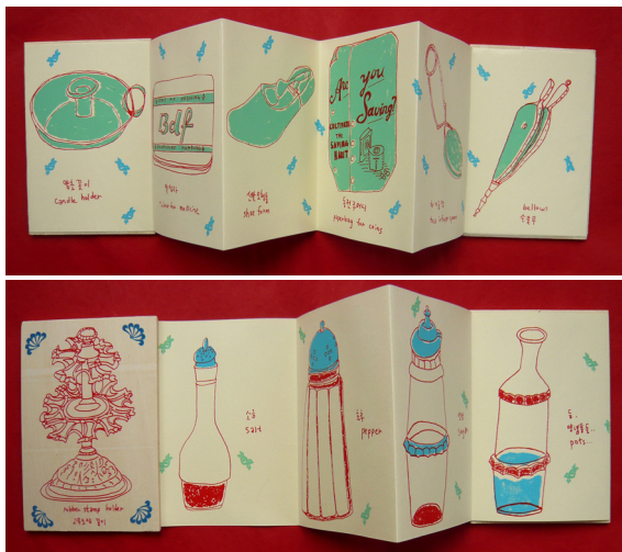
11 small antiques by Antic (Antique) Ham. Accordion book with 11 drawings of antiques purchased by the artist, 2009

Artists' books should reveal the artist's own good sense and confidence in expressing their feelings in the appropriate physical format of the book. Artists' books have two aspects, which are the content, and the book as a material object. Artists must think about both the content and materiality of the book at the same time. Materials for books, the way it is bound, a cover, how the pages will be turned, the construction and sequence and of course the content. The artist must ultimately control all these things, which go towards making a book.