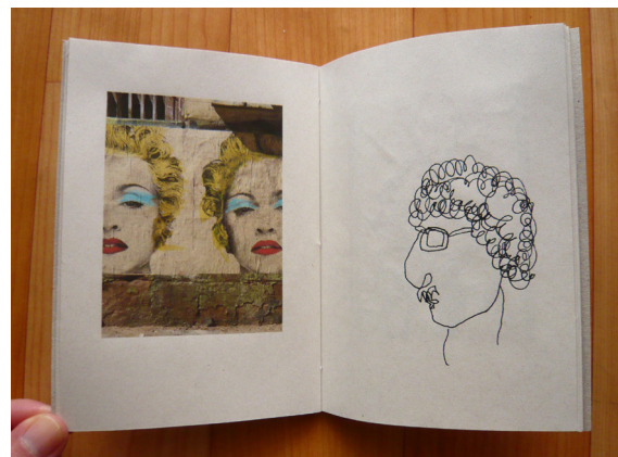
New Yorker by Antic Ham. Photographs taken in the streets of Soho, Chelsea and Queens in New York. Drawings of visitors at The New York Art Book Fair at PS1 MoMA. 44 pages, 169 copies, Inkjet, 10.5 x 15 cm, 2009

Have you been using the Internet to sell your work? Is this a popular way to market artists' books in Korea?