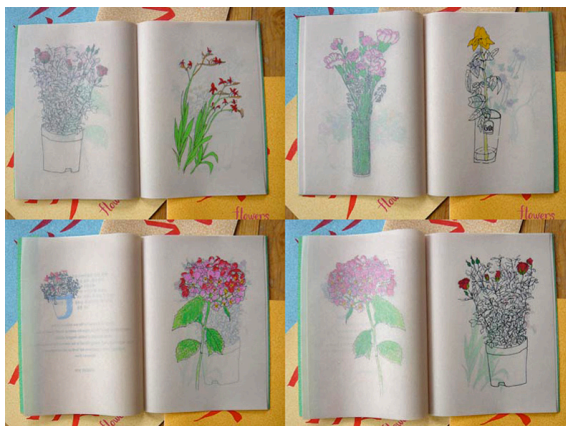
Flowers by Antic Ham 12 screenprints with added colouring from drawings of flowers. Printed on vintage tracing paper and hand painted wallpaper. 2009

I know some people who are teaching book art at schools and there are different kinds of courses. But I'm not sure how well artists' books are represented in these courses. As I said still all kinds of book works are mixed in Korea. And I'm not aware of any official collections or libraries for artists' books, but I know some artists and professors who have private collections they use for teaching.