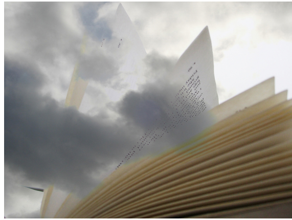
A Long Walk in Wintertime , Melanie Bush, 2009

http://www.weloveyourbooks.com http://www.bookarts.uwe.ac.uk http://www.wotadot.com http://www.myspace.com/luckydipcollective http://www.reassemble.co.uk http://www.carabarer.com http://www.alteredbookartists.com/gallery http://www.bettypepper.co.uk/page2.htm http://www.philobiblon.com http://www.centerforbookarts.org http://www.vam.ac.uk/collections/prints_books/features/artists_books/index.html http://www.jaketilson.com/publishing/books.htm http://www.shift.de/scripts/publications/index.php http://www.sandysykes.co.uk/BUTTONS.html http://www.thebookproject.com http://www.artstar.clara.net/traceybush.htm http://www.andreweason.com http://www.paperscissorsstone.info http://colophon.com/toc.html http://www.bibliopath.org/index.php http://www.the-case.co.uk http://www.artistsbooksonline.com/index.shtm