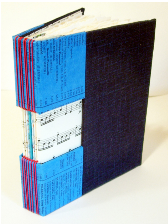
Composition: A Book about Books , Melanie Bush, 2008

For collecting - Artists' Books mostly & Artisan: Inkjet, Laser printed, Print-on-demand, Screen based/Internet, Linocut, Letterpress, Screenprint, Etching, Woodcut, Lithography, Altered books, Sculptural books, Photocopy, Hand-drawn/Letraset, sewn, textile, 3D/pop-up