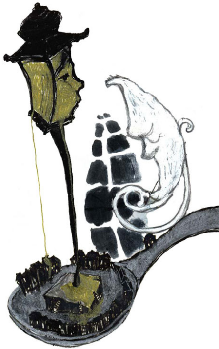
Fotelbujany , 2008

I haven't sold anything so far nor made a big attempt to. Most of my books are one-offs. Although if I had a target audience for my work, I wish it was the broader public or at least people interested in art and books.