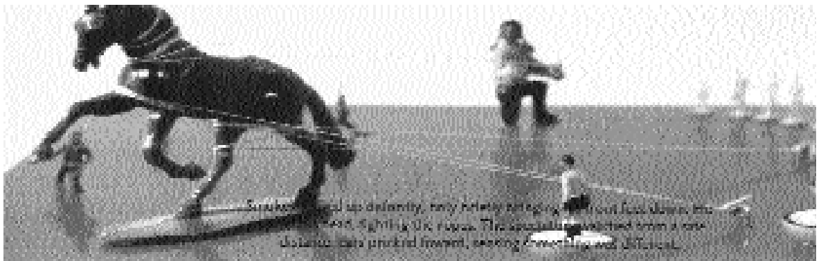
The Taming of Smokey Joe Tom Sowden, inkjet with cut wooden covers, 2002